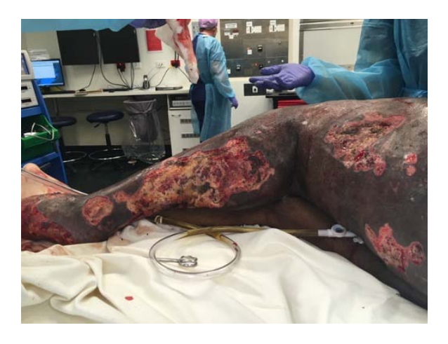
Fig. (2). Multiple non-healing ulcers of the left lower limb.

During this prolonged admission, the management involved (at minimum) weekly visits to the operating room for wound debridement and dressing changes. The individual also underwent 13 sessions of hyperbaric therapy, which was discontinued due to his refusal to participate. Sirolimus was trialed after international consultation, but as the arteriovenous malformations continued to increase in size, it ceased. Despite all efforts, the necrotic wounds relentlessly extended from his foot and ankle to involve his lower leg and thigh (Fig. 2). Spontaneous hemorrhage developed from the leg wound, requiring emergent surgical exploration and blood transfusion on four occasions during an eight-week period. Angiography demonstrated worsening diffuse arteriovenous malformation involving virtually all left pelvis, left upper, and left lower leg. MRI Coronal T2 sequences of the lower limbs demonstrated disproportionate tissue overgrowth and multiple disorganised dilated vasculatures throughout the left lower limb (Fig. 3).