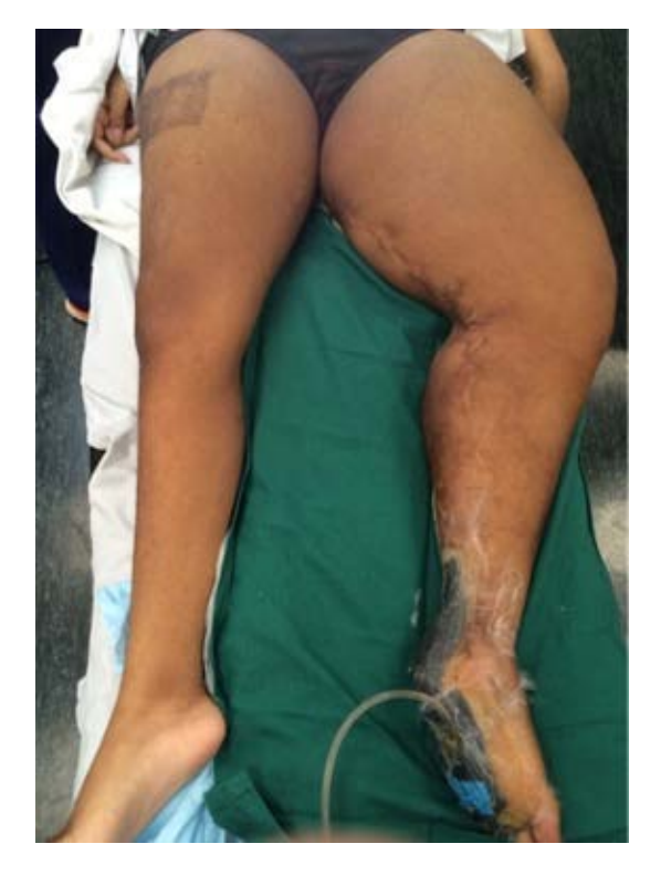
Fig. (1). Marked lower limb asymmetry.

A 12-year-old boy was admitted to the hospital with a nonhealing wound on his left lower leg. He identified as an indigenous Australian and lived in a remote community more than 500 km from our institution (the closest pediatric tertiary referral center). His past medical history was significant for the excision of an epidermal nevus on his left foot at age 6, the release of left foot contracture at age 7, deep venous thrombosis of the left leg at age 9, significant mobility issues and obesity (91kg, BMI 36). He had marked macrocephaly (Occipital-Frontal Circumference 61 cm, >2 SD above the mean) and lower limb asymmetry (Fig. 1). Multiple vascular malformations of the left lower limb, in conjunction with the history of an epidermal nevus, led to the presumptive diagnosis of CLOVES syndrome (Congenital Lipomatous Overgrowth, Vascular Malformations, Epidermal Nevi, Spinal/Skeletal Anomalies/Scoliosis syndrome). A sample of skin from the affected area was taken, and a heterozygous PTEN nonsense variant was identified (PTEN:c.445C>T (pO149*) in exon 5. This variant was subsequently also identified in blood, confirming germline PHTS. Consequently, the diagnosis was revised to PTEN hamartoma tumor syndrome. The variant was also identified in his father, who has macrocephaly, a history of leukemia, and a right frontal meningioma. However, he does not have vascular malformations.